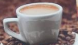
100 % Organic Arabica Coffee